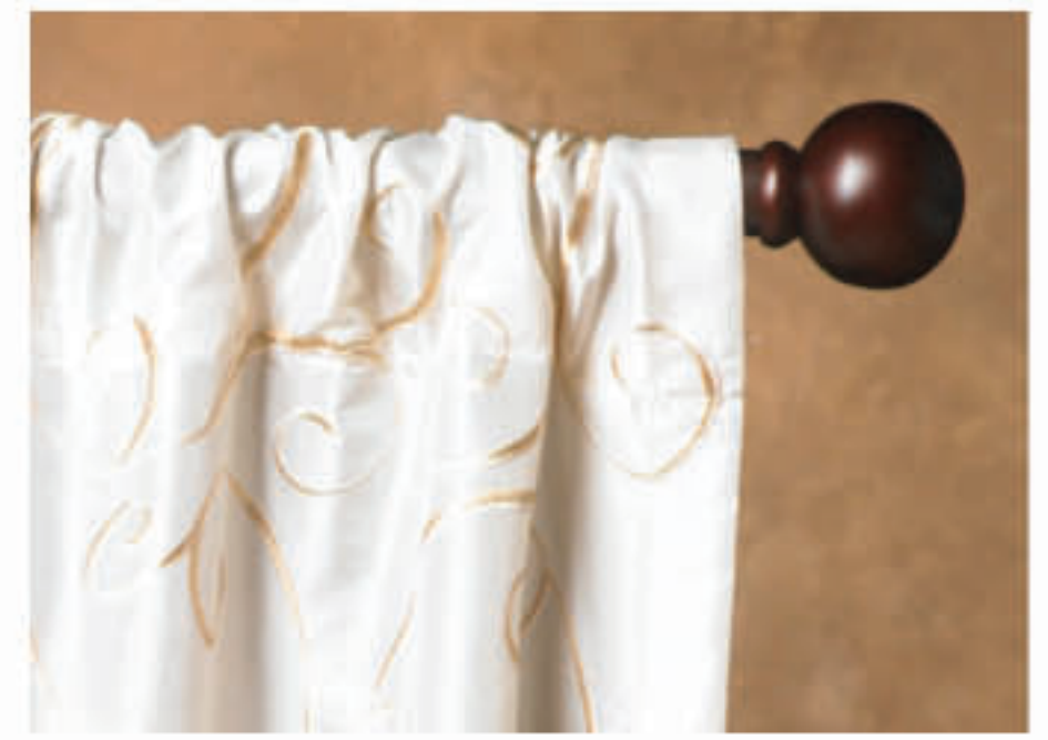
Rod Pocket (no header)