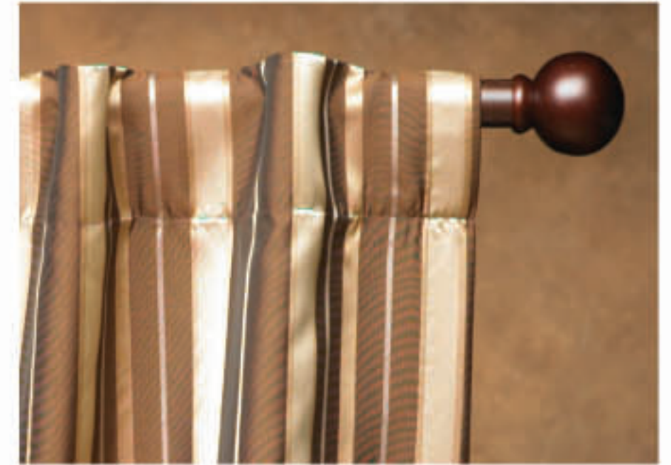
Back Tab/ Design Tab