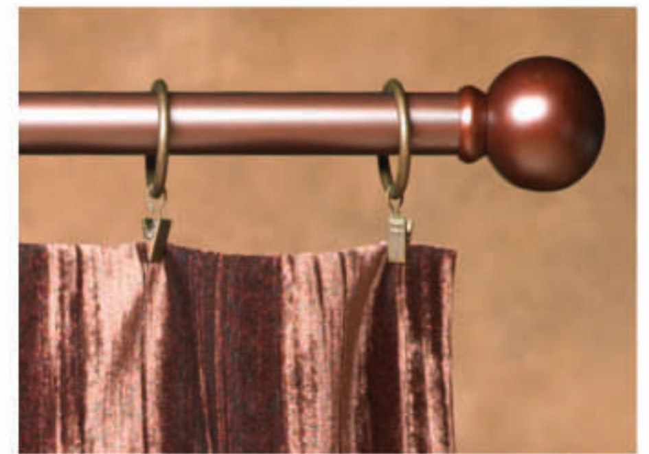
Ring Top/ Clip